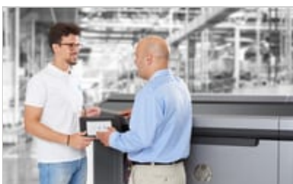
HP Jet Fusion 3D 4200 Printer -