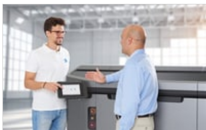
HP Jet Fusion 3D 4200 Printer - Support and service image, Two mens talking standing next to a 3D Pr