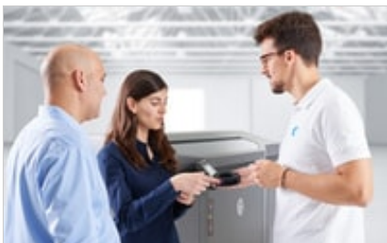
HP Jet Fusion 3D 4200 Printer - Support and service image, Two mens and a woman talking standing nex