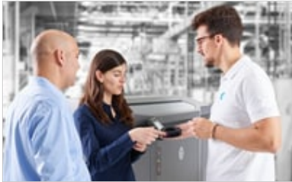
HP Jet Fusion 3D 4200 Printer - Support and service image, Two mens and a woman talking standing nex