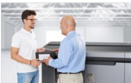
HP Jet Fusion 3D 4200 Printer - Support and service image, Two mens talking standing next to a 3D Pr