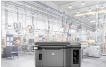
HP Jet Fusion 3D 4200 Printer - Chain enviro image, blur background