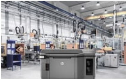
HP Jet Fusion 3D 3200 Printer - Chain enviro image