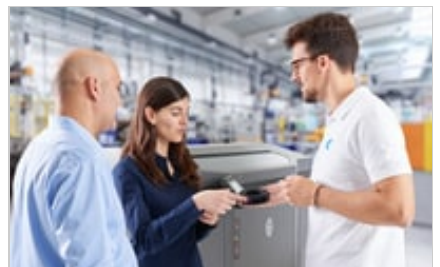
HP Jet Fusion 3D 4200 Printer - Support and service image, Two mens and a woman talking and sharing