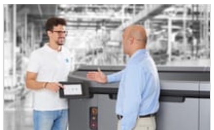
HP Jet Fusion 3D 4200 Printer - Support and service image, Two mens talking standing next to a 3D Pr