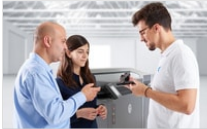
HP Jet Fusion 3D 4200 Printer - Support and service image, Two mens and a woman talking standing nex