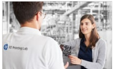
HP Jet Fusion 3D 4200 Printer - Support and service image, a man and a woman talking standing next t