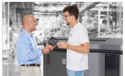
HP Jet Fusion 3D 4200 Printer - Support and service image, Two mens talking standing next to a 3D Pr