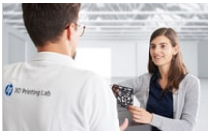
HP Jet Fusion 3D 4200 Printer - Support and service image, a man and a woman talking standing next t