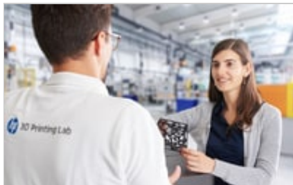
HP Jet Fusion 3D 4200 Printer - Support and service image, a man and a woman talking standing next t