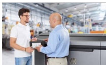
HP Jet Fusion 3D 4200 Printer -