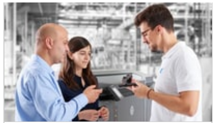
HP Jet Fusion 3D 4200 Printer - Support and service image, Two mens and a woman talking standing nex