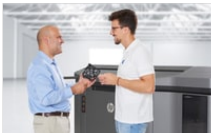
HP Jet Fusion 3D 4200 Printer - Support and service image, Two mens talking standing next to a 3D Pr