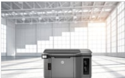
HP Jet Fusion 3D 4200 Printer - Factory enviro image, view 2