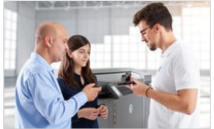
HP Jet Fusion 3D 4200 Printer - Support and service image, Two mens and a woman talking standing nex