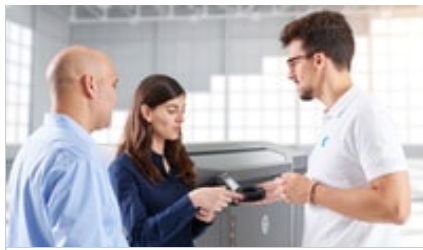
HP Jet Fusion 3D 4200 Printer - Support and service image, Two mens and a woman talking standing nex