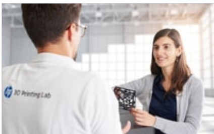
HP Jet Fusion 3D 4200 Printer - Support and service image, a man and a woman talking standing next t