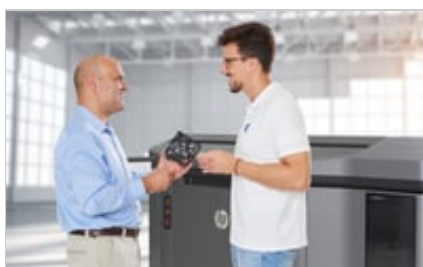
HP Jet Fusion 3D 4200 Printer -