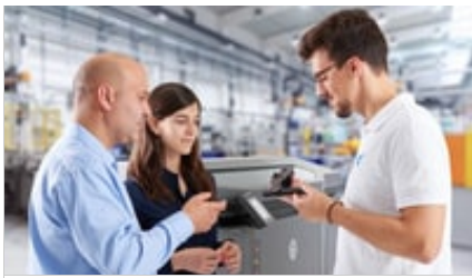
HP Jet Fusion 3D 4200 Printer - Support and service image, Two mens and a woman talking and sharing