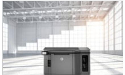
HP Jet Fusion 3D 4200 Printer - Factory enviro image